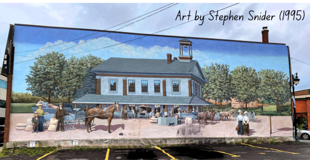
Art by Stephen Snider (1995)

A painted mural that commemorates an old photo of the market in the early 1900's. It was a time of horse-drawn buggies, dirt walking streets and outdoor marketplaces bustling with activity. This pays homage to our regions strong agricultural history and calls back a way of life from just 100 years ago.