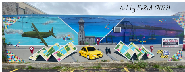
Art by SeRnA (2022)

From point A to point B, this mural takes you on a tour of Trenton's most iconic landmarks.